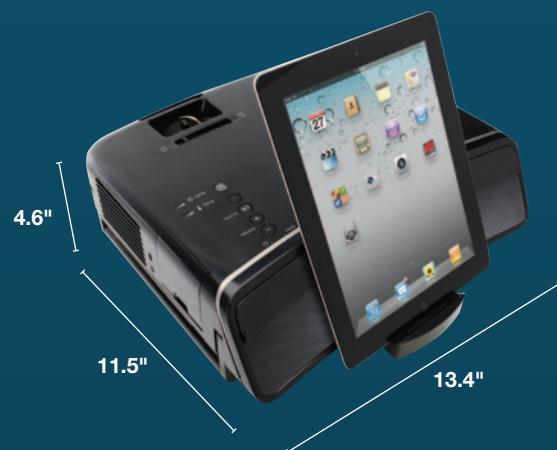
▲ Built-in Apple dock