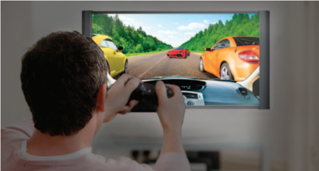
Play larger-than-life video games with vibrant color graphics. Just connect your Nintendo® Wii™, Microsoft® Xbox 360® or Sony® PS3.

Brilliant, awe-inspiring projection lets you display media from virtually any digital device with stunning clarity and color up to 12x larger than a 40-inch screen.